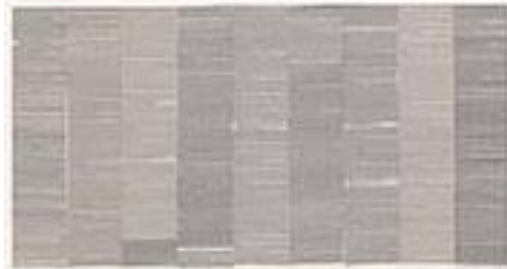
Simryn Gill, Singaporean, born 1959 Where to draw the line , 2011–12 Typewriting on nine sheets of paper 40 1/4 x 74 3/4" (102.2 x 189.9 cm)

Untitled (Learning from That Person's Work: Room 1) is a large-scale manifestation of that person's activity. This disorienting, maze-like installation consists of twelve parts, in which bed sheets are covered with nine collaged ink-on-paper drawings. An accompanying video brings that person—mumbling and humming to voices he hears as the water fills and drains from a bathtub—directly into the installation. This immersive environment invites viewers to step into the wild terrain of Mullican's subconscious—and that person's reality.