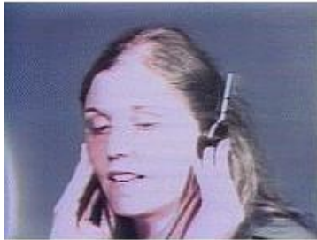
Richard Serra, American, born 1939, with Nancy Holt, American, 1938–2014 Boomerang , 1974 Video (color, sound) 10 min.

In Tender Buttons and How to Write , Stein altered the grammatical structures and social functions of ordinary language. Fowler takes Stein's language—which Fowler describes as queer—from the intimate setting of a book and transposes it into the public realm. As a result, the difference in value assigned to literature and the language of advertising is equalized. At the end of the project, Fowler replaced each poster with a new one that had no text except "Gertrude Stein" in small type along the bottom edge, where the name of the printer usually appears.