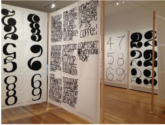
Matt Mullican, American, born 1951 Untitled (Learning from That Person's Work: Room 1) , 2005 Installation of ink on paper collage mounted on twelve cotton sheets, wood, cable, and video component (color, sound; 14:04 min.) 12 units, 109 x 88.5 in. each. Installation dimensions variable.

Acquired through the generosity of the Contemporary Arts Council of The Museum of Modern Art and the Friends of Contemporary Drawing