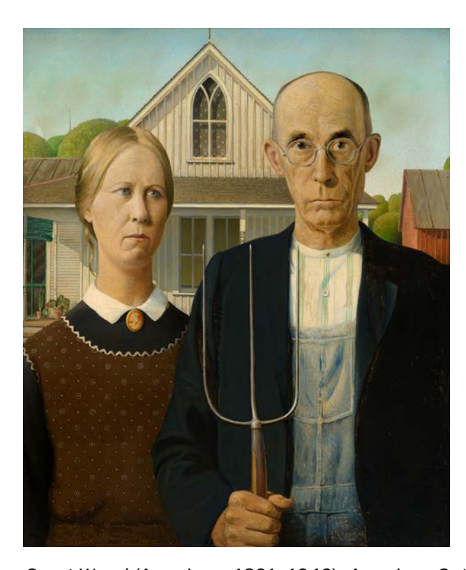
Grant Wood (American, 1891–1942). American Gothic . 1930. Oil on beaverboard, 30 % × 25 %" (78 × 65.3 cm). The Art Institute of Chicago. Friends of American Art Collection

Framed by a doorway, one massive hand on her hip and the other grasping a pitchfork, White's female farmer asserts ownership over the landscape before her, even before we learn the title of the painting, Our Land . Her choice of tool connects her with the couple in Grant Wood's iconic painting American Gothic (1930), which White would have seen at the Art Institute of Chicago. But the similarities end there: White's self-reliant woman suggests the essential cultural and economic role that African American women have played in the United States, one of the artist's most enduring themes.