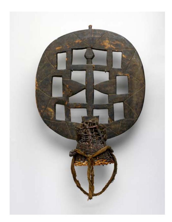
Poro Headdress (Kworo). Nineteenth to mid-twentieth century. Northern Côte d'Ivoire, Bandama River region, Senufo peoples. Wood, cloth, cane, and mud, 29\frac{1}{8}\times22\times6\frac{1}{2} " (74 × 55.9 × 16.5 cm). The Metropolitan Museum of Art. The Michael C. Rockefeller Memorial Collection, Gift of Allan Frumkin, 1962.

This drawing includes an interpretation of a Kworo mask included in the 1963 exhibition Senufo Sculpture from West Africa, organized by the Museum of Primitive Art, in New York. White may have been working from a picture published in the exhibition catalogue, and he added elements of other masks produced by different cultural groups. The inclusion of African masks, a novel motif for the artist, is explained by a note on the back of the drawing, which indicates that it, together with several other drawings in the J'Accuse series, was intended as an illustration for the "African Heritage" section of Harry Belafonte's anthology History of Negro Music. The anthology was only realized in 2001, as The Long Road to Freedom: An Anthology of Black Music.