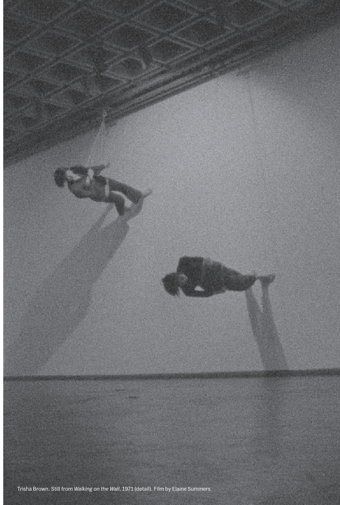
Trisha Brown. Still from Walking on the Wall , 1971 (detail). Film by Elaine Summers