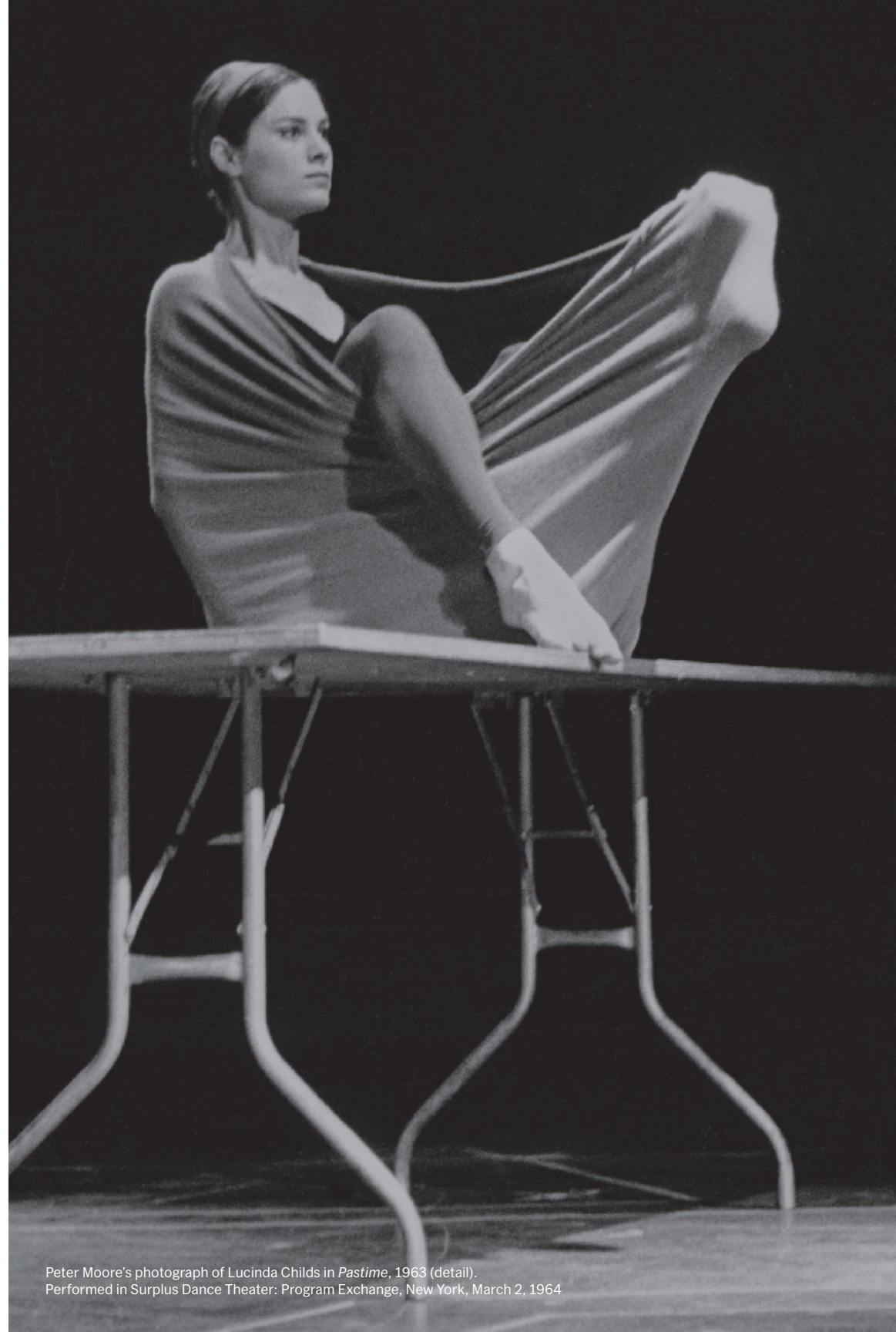
Peter Moore's photograph of Lucinda Childs in Pastime , 1963 (detail). Performed in Surplus Dance Theater: Program Exchange, New York, March 2, 1964