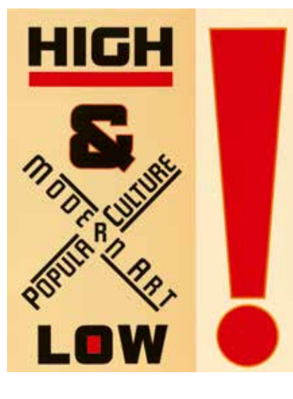
Fig. 12. Cover of the exhibition catalogue for High and Low: Modern Art and Popular Culture , The Museum of Modern Art, New York, October 7, 1990–January 15, 1991. Publications Archive. MOMA Archives. NY

Controversial exhibition "Primitivism" in 20th Century Art: Affinity of the Tribal and the Modern illustrates influence of so-called primitive art on modern expression (fig. 11).