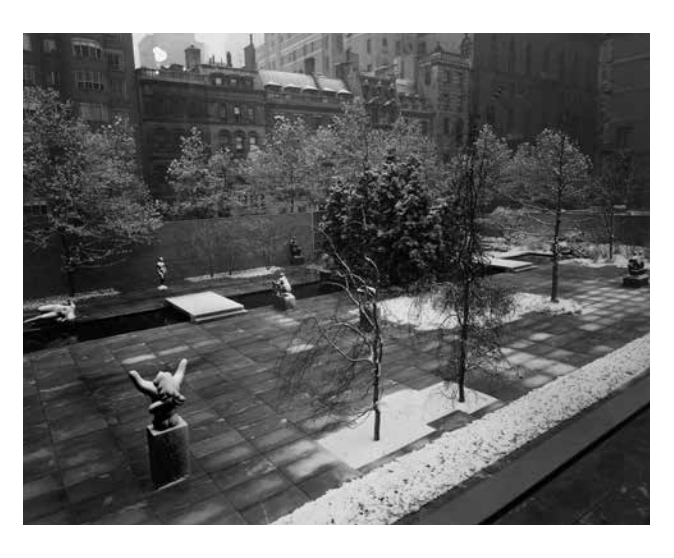
Fig. 7. The Abby Aldrich Rockefeller Sculpture Garden. designed by Philip Johnson, 1953.

Led by Porter McCray as director, the International Program is founded to promote modern art abroad, largely through traveling exhibitions (p. 106). Under the program's auspices, the Museum organizes the American representation at the Venice Biennale as well from 1954 to 1962, during which time MoMA owns the U.S. Pavilion.