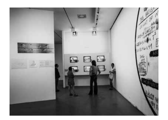
Fig. 9. Installation view of Information , The Museum of Modern Art New York, July 2–September 20, 1970.