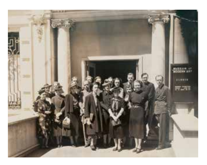
Fig. 3. The staff of the Museum in front of the townhouse at 11 West 53rd Street before the move to temporary quarters, 1937.

The Museum temporarily relocates to the Rockefeller Center concourse at 14 West 49th Street so that the townhouse it has occupied can be demolished in preparation for construction of a new flagship building designed by Philip L. Goodwin and Edward Durrell Stone (fig. 3).