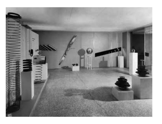
Fig. 2. Installation view of Machine Art , The Museum of Modern Art, New York, March 5-April 29, 1934.

This chronology presents an overview of some of the many facets of MoMA's illustrious history. In addition to noting landmark and iconic exhibitions, an effort has been made to highlight the depth and diversity of the Museum's exhibition program, as well as other innovative efforts to promote and engage the public with the art of our time.