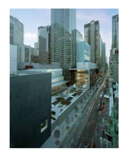
Fig. 13. The Museum of Modern Art following construction of new building designed by Yoshio Taniguchi, 2004.