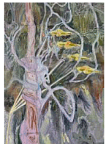
MICHAEL ARMITAGE Seraph 2017 Oil on Lubugo bark cloth 78 3/4 × 59 1/16" (200 × 150 cm) Private Collection LN2019.421