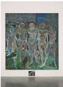
MICHAEL ARMITAGE Nyali Beach Boys 2016 Oil on Lubugo bark cloth 96 7/16 × 92 1/2" (245 × 235 cm) Dallas Museum of Art, TWO x TWO for AIDS and Art Fund LN2019.420