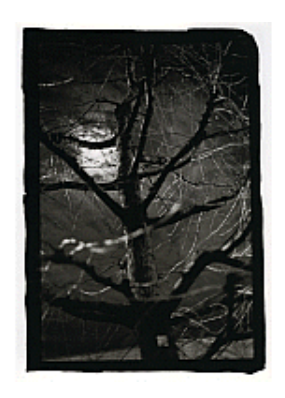
Ming Smith, American Tokyo Moonlight Figuration I, Tokyo, Japan, 1985 UV print on dibond Sheet: 36 × 24" (91.4 × 61 cm)