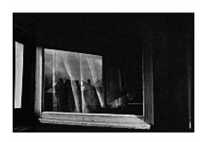
Ming Smith, American The Window Overlooking Wheatland Street Was My First Dreaming Place, 1979 UV print on dibond Sheet: 40 × 60" (101.6 × 152.4 cm)