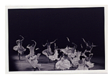
Ming Smith, American Black Dance, 1981 UV print on dibond Sheet: 40 × 60" (101.6 × 152.4 cm)