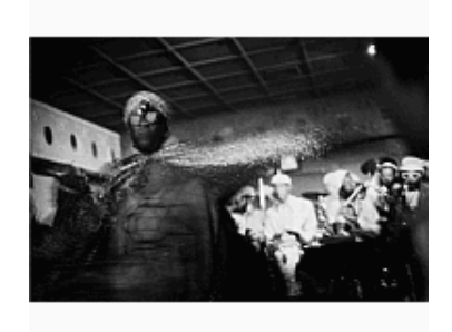
Ming Smith, American Sun Ra Space II, New York, NY, 1978 UV print on dibond Sheet: 47 × 72" (119.4 × 182.9 cm)