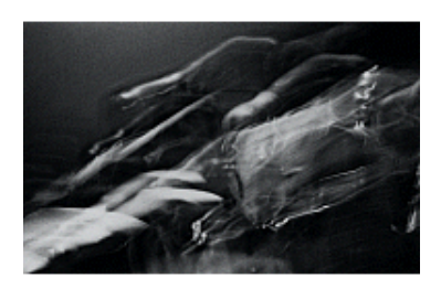
Ming Smith, American Cascading Light, 1981 UV print on dibond Sheet: 16 × 24" (40.6 × 61 cm)