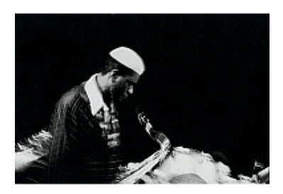
Ming Smith, American Pharoah Sanders at the Bottom Line, 1977 UV print on dibond Sheet: 47 × 72" (119.4 × 182.9 cm)