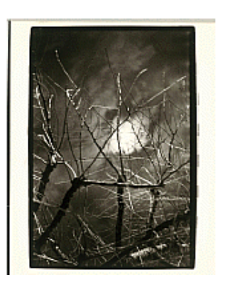
Ming Smith, American Tokyo Moonlight Figuration II, Tokyo, Japan, 1985 UV print on dibond Sheet: 36 × 24" (91.4 × 61 cm)