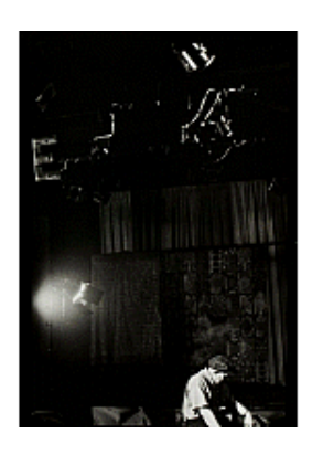
Ming Smith, American Spiral, Romare Bearden, 1977 UV print on dibond Sheet: 36 × 24" (91.4 × 61 cm) Courtesy of the artist