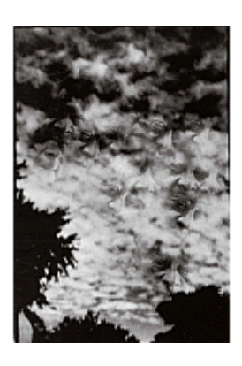
Ming Smith, American James Van Der Zee, New York City, New York, 1972/1991 UV print on dibond Sheet: 72 × 47" (182.9 × 119.4 cm)