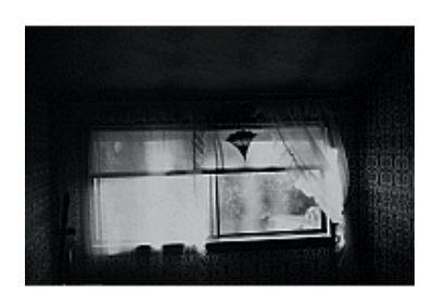
Ming Smith, American Roxbury Interior, Boston, MA, 1978 UV print on dibond Sheet: 16 × 24" (40.6 × 61 cm)