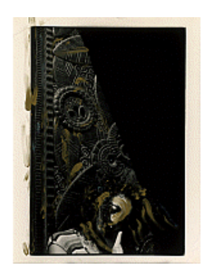
Ming Smith, American Self Portrait Trio, 1978 oil paint on gelatin silver print

Frame: 27 1/4 × 21 1/4 × 1 1/2" (69.2 × 54 × 3.8 cm)