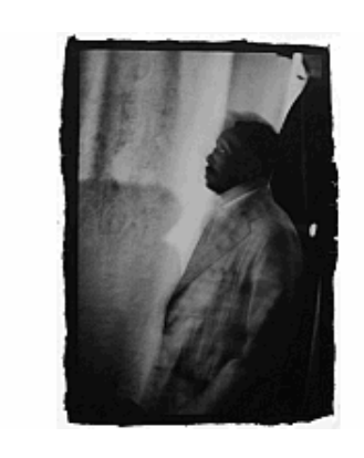
Ming Smith, American Randy Weston On Next, Saalfelden, Austria, 1980 UV print on dibond Sheet: 60 × 40" (152.4 × 101.6 cm)