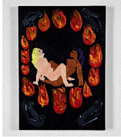
FRIEDA TORANZO JAEGER (Mexican, b. 1988) The Beginning of the End 2020 Oil and embroidery on canvas 13 3/4 × 9 13/16" (35 × 25 cm) Collection Jarrett Gregory

MoMA PS1, September 22, 2022 - March 13, 2023