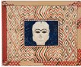
NUHA AL-RADI (Iraqi, 1941–2004) Queen of Uruk 1999 Acrylic on wood 18 1/2 × 22 1/2" (47 × 57.2 cm) Private collection, New York

MoMA PS1, November 03, 2019 - March 01, 2020