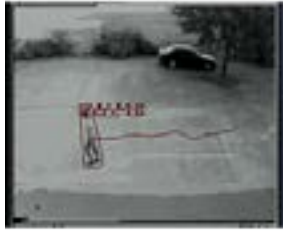
HARUN FAROCKI (German, 1944–2014) War at a Distance 2003 Video (color, sound) 58 min. The Museum of Modern Art, New York. Committee on Film Funds

MoMA PS1, November 03, 2019 - March 01, 2020