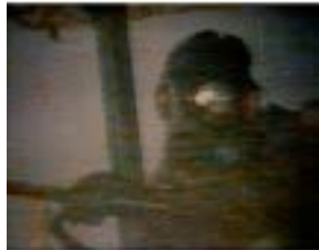
TAREK AL-GHOUSSEIN (Kuwaiti and Palestinian, born 1962) GW 077 1991 Polaroid 11 x 8" (27.9 x 20.3 cm) (framed)