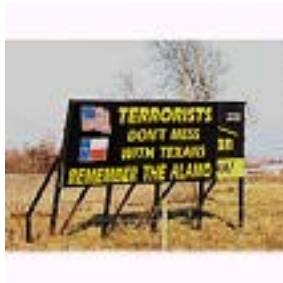
DEBORAH STRATMAN (American, born 1967) Energy Country 2003 Video (b/w, color, sound) 14 min., 30 sec.