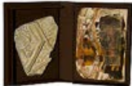
DIA AL-AZZAWI (Iraqi and British, born 1939) Book of Shame: Destruction of the Iraq Museum 2003 Mixed media (plaster, ink, paper, and card) inside Solander case closed: 10 7/16 × 7 1/2 × 1 15/16" (26.5 × 19 × 5 cm) open: 10 7/16 × 16 9/16 × 1 9/16" (26.5 × 42 × 4 cm)