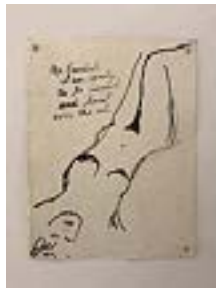
KAREN FINLEY (American, born 1956) Untitled 2004 Ink on paper 12 × 9 1/8" (30.5 × 23.2 cm)