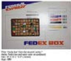
MIGUEL ANGEL RÍOS (Argentinian, born 1943) Souvenir Series: Candy Box 1991 FedEx box and watercolor on cardboard 18 x 12 1/2 x 3" (45.7 x 31.7 x 7.6 cm) Courtesy the artist and Sicardi Ayers Bacino