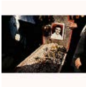
SUSAN MEISELAS (American, born 1948) Gravestone of Peshmerga martyr, Saiwan Hill cemetery. Erbil, Northern Iraq, Kurdistan December 1991 Digital C-print 16 x 24" (40.6 x 61 cm)