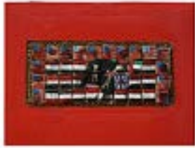
MIGUEL ANGEL RÍOS (Argentinian, born 1943) Souvenir Series: Oro Negro 1992 Watercolor on cardboard 12 x 9 x 2 1/2" (30.5 x 22.9 x 6.4 cm)

MoMA PS1, November 03, 2019 - March 01, 2020