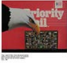
MIGUEL ANGEL RÍOS (Argentinian, born 1943) Souvenir Series: Just in Time 1991 Priority Mail box, acrylic on cardboard 12 1/2 x 15 1/2 x 3 1/4" (31.8 x 39.4 x 8.3 cm) Courtesy the artist and Sicardi Ayers Bacino

MoMA PS1, November 03, 2019 - March 01, 2020