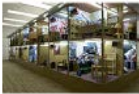
THOMAS HIRSCHHORN (Swiss, born 1957) Hotel Democracy 2003 Mixed media 144 x 612 x 168" (365.8 x 1554.5 x 426.7 cm) Courtesy the artist and Stephen Friedman Gallery, London