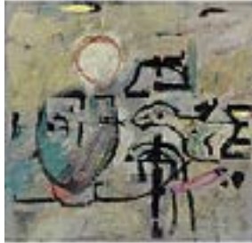
HANAA MALALLAH (Iraqi and British, born 1958) Reflection of White Moon 1999 Oil on canvas 12 5/8 × 12 5/8" (32 × 32 cm)