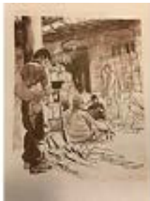
STEVE MUMFORD (American, born 1960) Booksellers on Mutanebi Street, Baghdad 2003 Ink on paper 13 3/8 × 11" (34 × 27.9 cm) Courtesy the artist and Postmasters, New York