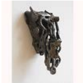
MELVIN EDWARDS (American, born 1937) Iraq 2003 Welded steel 13 x 7 x 7" (33 x 17.8 x 17.8 cm) Courtesy the artist, Alexander Gray Associates, New York, and Stephen Friedman Gallery, London