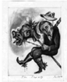
SUE COE (British and American, born 1951) The Cowboy 2004 Graphite on white Strathmore Bristol board 9 1/8 × 7 1/2" (23.2 × 19.1 cm) Courtesy the artist and Galerie St. Etienne, New York