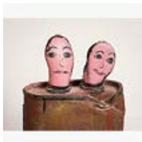
NUHA AL-RADI (Iraqi, 1941–2004) Portrait of Aysar Akrawi and Adnan Habboo 1995 Painted metal canister and rock 14 × 4" (35.6 × 10.2 cm) Collection Aysar Akrawi