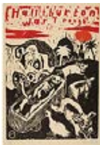
SUE COE (British and American, born 1951) Halliburton War Trough 2005 Colored woodcut on natural Kitakata paper Image: 16 x 11 1/4" (40.6 x 28.6 cm) Courtesy the artist and Galerie St. Etienne, New York