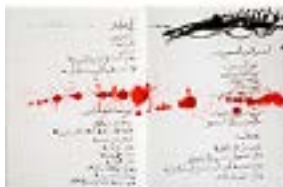
DIA AL-AZZAWI (Iraqi and British, born 1939) Cars and Bullets and Blood: Abdul Zahra Zaki 2013 Gouache and ink on paper 14 9/16 x 11 1/4 x 1 3/16" (37 x 28.5 x 3 cm) Courtesy the artist