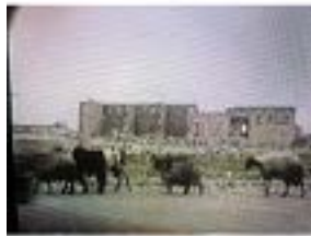
SUSAN MEISELAS (American, born 1948) Destroyed Villages 1991 Video 7 min., 19 sec.