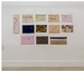
ALI EYAL (Iraqi, born 1994) Painting Size 80 x 60 cm 2018 Oil paint on textile Dimensions variable Courtesy the artist