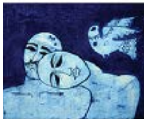
THURAYA AL-BAQSAMI (Kuwaiti, born 1951) The Parting 1991 Etching 11 13/16 × 15 3/4" (30 × 40 cm) Courtesy the artist