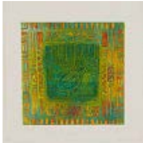
NUHA AL-RADI (Iraqi, 1941–2004) Just a Bird 1996 Lithograph 7 1/2 × 7 1/2" (19.1 × 19.1 cm) Private collection, New York