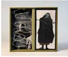
DIA AL-AZZAWI (Iraqi and British, born 1939) Just Got Harder 2010 Mixed media with wooden box 12 3/16 × 11 1/4 × 1 15/16" (31 × 28.5 × 5 cm) Courtesy the artist

MoMA PS1, November 03, 2019 - March 01, 2020