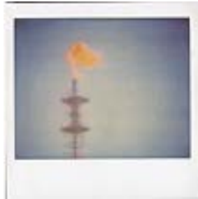
TAREK AL-GHOUSSEIN (Kuwaiti and Palestinian, born 1962) GW 117 1991 Polaroid 11 × 8" (27.9 × 20.3 cm) (framed)