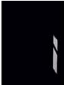
LOUISE LAWLER (American, born 1947) No Official Estimate (Sun/Sol) 2004/2007 6 chromogenic color prints with text on wall: "650,000 / 56,640-62,362 / 654,965 / 34,452 / 30,000" [Different calculations for Iraqi civilian deaths as reported by various media outlets in 2006 and 2007] Each: 39 5/8 x 29 5/8" (100.6 x 75.2 cm) Courtesy the artist and Metro Pictures, New York