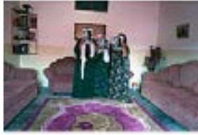
JAMAL PENJWENY (Iraqi and Kurdish, born 1981) Saddam is Here 2010 Photograph 23 5/8 x 31 1/2" (60 x 80 cm)

MoMA PS1, November 03, 2019 - March 01, 2020