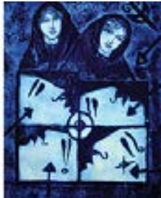
THURAYA AL-BAQSAMI (Kuwaiti, born 1951) Martyr's Mothers 1991 Etching 15 3/4 × 12 5/8" (40 × 32 cm) Courtesy the artist