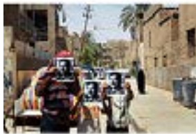
JAMAL PENJWENY (Iraqi and Kurdish, born 1981) Saddam is Here 2010 Photograph 23 5/8 x 31 1/2" (60 x 80 cm)