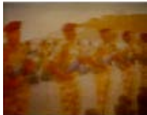
TAREK AL-GHOUSSEIN (Kuwaiti and Palestinian, born 1962) GW 334 1991 Polaroid 11 x 8" (27.9 x 20.3 cm) (framed)