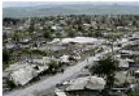
SUSAN MEISELAS (American, born 1948) Families return to ruins of their homes after the Iraqi army forced them to leave in 1989. Qala Diza, Northern Iraq, Kurdistan 1991 Digital C-print 16 x 24" (40.6 x 61 cm)