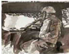
STEVE MUMFORD (American, born 1960) Combat Outpost "Rock," Mosul, Iraq 2008 Ink on paper 13 3/4 x 18" (34.9 x 45.7 cm)