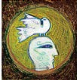
THURAYA AL-BAQSAMI (Kuwaiti, born 1951) Unhappy News 1991 Pastel and acrylic on board 11 13/16 × 11 13/16" (30 × 30 cm)