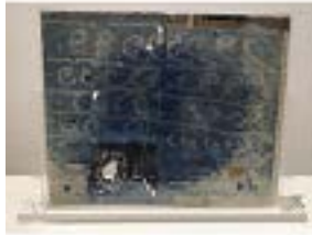
SHAKIR HASSAN AL SAID (Iraqi, 1925–2004) Untitled 1994 Mixed media on paper 12 5/8 × 15 3/4" (32 × 40 cm)