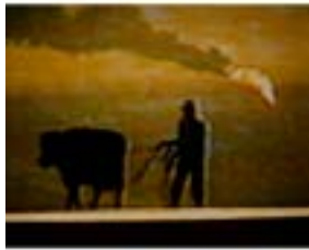
TAREK AL-GHOUSSEIN (Kuwaiti and Palestinian, born 1962) GW 52 1991 Polaroid 11 × 8" (27.9 × 20.3 cm) (framed)