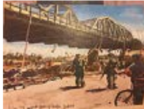
STEVE MUMFORD (American, born 1960) Bridge Blown Up by Insurgents, Baghdad, Iraq 2007 Ink and gouache on paper 11 3/4 x 15 5/8" (29.8 x 39.7 cm)