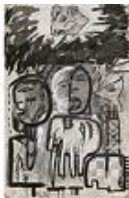
HANAA MALALLAH (Iraqi and British, born 1958) In the Name of War 1993 Ink and charcoal on hardboard 31 1/2 × 20 7/8" (80 × 53 cm) Courtesy the artist