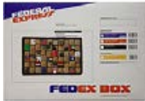
MIGUEL ANGEL RÍOS (Argentinian, born 1943) Souvenir Series: Priority Overnight No. 1 1991 FedEx box and watercolor on cardboard 18 x 11 x 3 1/4" (45.7 x 27.9 x 8.3 cm)