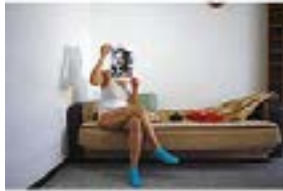
JAMAL PENJWENY (Iraqi and Kurdish, born 1981) Saddam is Here 2010 Photograph 23 5/8 x 31 1/2" (60 x 80 cm)