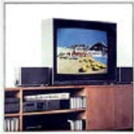
RICHARD HAMILTON (British, 1922–2011) War Games 1991–2010 EFI VUTEK inkjet solvent print on canvas 118 1/8 × 118 1/8" (300 × 300 cm) The Estate of Richard Hamilton

MoMA PS1, November 03, 2019 - March 01, 2020