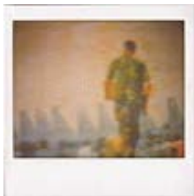
TAREK AL-GHOUSSEIN (Kuwaiti and Palestinian, born 1962) GW 169 1991 Polaroid 11 x 8" (27.9 x 20.3 cm) (framed)