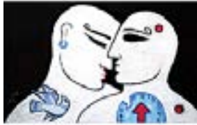
THURAYA AL-BAQSAMI (Kuwaiti, born 1951) The Hour of Martyrdom 1991 Pastel and acrylic on paper 17 11/16 × 27 9/16" (45 × 70 cm)