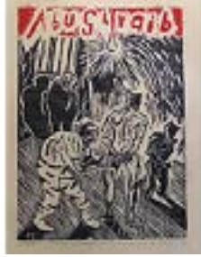
SUE COE (British and American, born 1951) Abu Ghraib 2005 Colored woodcut on natural Kitakata paper Image: 15 5/8 × 11 1/4" (39.7 × 28.6 cm) Courtesy the artist and Galerie St. Etienne, New York

MoMA PS1, November 03, 2019 - March 01, 2020