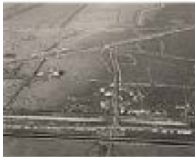
SOPHIE RISTELHUEBER (French, born 1949) A cause de l'élevage de poussière (Because of Dust Breeding) 1991–2007 Pigment print mounted on aluminum 60 × 75" (152.4 × 190.5 cm)