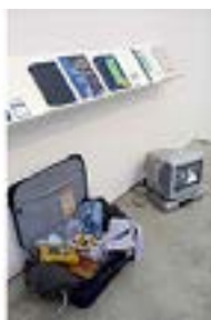
JALAL TOUFIC (Lebanese, born 1962) The Return of the Dual-Use Memorial 2016 Installation Dimensions variable Courtesy the artist