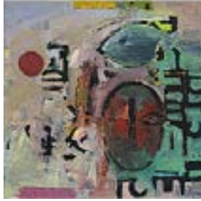
HANAA MALALLAH (Iraqi and British, born 1958) Reflection of Red Moon 1999 Oil on canvas 12 5/8 × 12 5/8" (32 × 32 cm) Courtesy the artist

MoMA PS1, November 03, 2019 - March 01, 2020