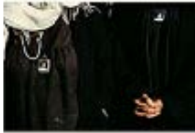
SUSAN MEISELAS (American, born 1948) Family members wear the photographs of Peshmerga martyrs in the Saiwan Hill cemetery. Erbil, Northern Iraq, Kurdistan December 1991 Digital C-print 20 x 30" (50.8 x 76.2 cm) Courtesy the artist