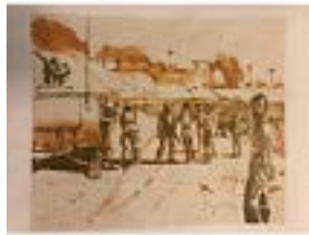
STEVE MUMFORD (American, born 1960) Florida National Guard Patrol Looking for Weapons Cache by the Tigris 2003 Ink and pencil on paper 11 × 13 5/8" (27.9 × 34.6 cm) Courtesy the artist and Postmasters, New York