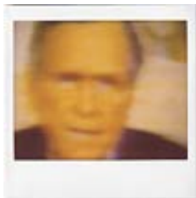
TAREK AL-GHOUSSEIN (Kuwaiti and Palestinian, born 1962) GW 989 1991 Polaroid 11 × 8" (27.9 × 20.3 cm) (framed)