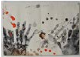
RAFA NASIRI (Iraqi, 1940–2013) War Diary 2 (No, It's a Dirty War) 1991 Ink and acrylic on rice paper 11 7/16 × 250 13/16" (29 × 637 cm)