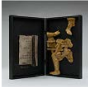
DIA AL-AZZAWI (Iraqi and British, born 1939) Selections from Silent Ticker: Abdul Zahra Zaki 2017 Mixed media (gouache, ink, paper, and painted plaster) inside hinged wooden box 14 3/16 × 9 7/16 × 2 3/16" (36 × 24 × 5.5 cm) 14 3/16 × 18 7/8 × 1 3/16" (36 × 48 × 3 cm) Courtesy the artist