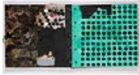
HANAA MALALLAH (Iraqi and British, born 1958) Book of Sanction 1 2001 Mixed media (acrylic, collage, and burning on paper and wood, with metal); 24 pages 14 3/4 × 15 3/4" (37.5 × 40 cm) Azzawi Collection, London

MoMA PS1, November 03, 2019 - March 01, 2020