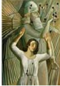
AFIFA ALEIBY (Iraqi and Dutch, born 1952) Gulf War 1991 Oil on canvas 39 3/8 × 27 9/16" (100 × 70 cm) Collection Rana Sadik and Samer Younis, Kuwait