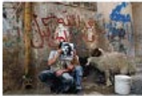
JAMAL PENJWENY (Iraqi and Kurdish, born 1981) Saddam is Here 2010 Photograph 23 5/8 x 31 1/2" (60 x 80 cm)