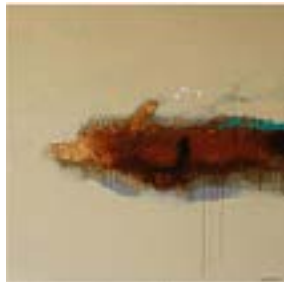
RAFA NASIRI (Iraqi, 1940–2013) Beside The River 2013 Acrylic on canvas 55 1/8 x 55 1/8" (140 x 140 cm) Courtesy Rafa Nasiri Studio, Amman