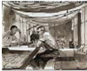
STEVE MUMFORD (American, born 1960) Soldiers Playing Chess, Mosul, Iraq 2008 Ink on paper 14 × 18" (35.6 × 45.7 cm) Courtesy the artist and Postmasters, New York