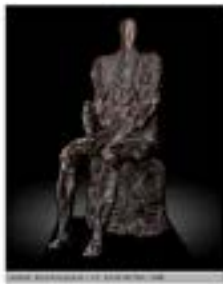
ISMAIL FATTAH (Iraqi, 1934–2004) Untitled 1998 Bronze 15 3/4 × 6 11/16 × 7 7/8" (40 × 17 × 20 cm) Ibrahimi Collection