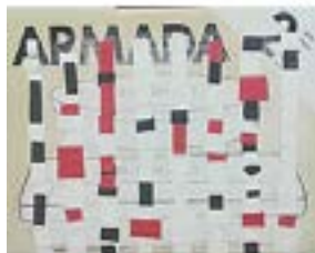
MIGUEL ANGEL RÍOS (Argentinian, born 1943) Armada 1992 Collage on box 9 3/4 x 60 1/2 x 3" (24.8 x 153.7 x 7.6 cm)