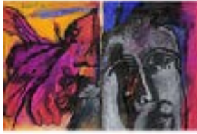
DIA AL-AZZAWI (Iraqi and British, born 1939) War Diary No. 1 1991 Gouache, China ink, and charcoal on paper; 28 pages 12 5/8 × 9 7/16" (32 × 24 cm) Case: 15 3/4 × 11 13/16" (40 × 30 cm) Courtesy the artist

MoMA PS1, November 03, 2019 - March 01, 2020