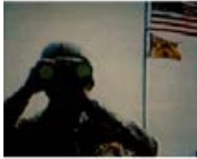
TAREK AL-GHOUSSEIN (Kuwaiti and Palestinian, born 1962) GW 333 1991 Polaroid 11 × 8" (27.9 × 20.3 cm) (framed)

MoMA PS1, November 03, 2019 - March 01, 2020