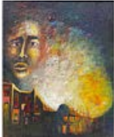
KHALIFA QATTAN (Kuwaiti, 1934–2003) Kuwait is Burning 1971 Oil on fiber 23 5/8 × 19 11/16" (60 × 50 cm) The Khalifa & Lidia Qattan Art Museum (The Mirror House), Kuwait