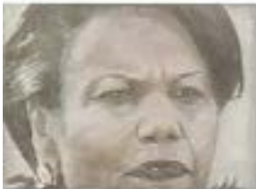
LUC TUYMANS (Belgian, born 1958) The Secretary of State 2005 Oil on canvas 18 x 24 3/8" (45.7 x 61.9 cm) The Museum of Modern Art, New York. Fractional and promised gift of David and Monica Zwirner