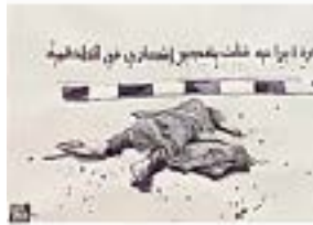
GHAITH ABDULAHAD (Iraqi, born 1975) The body of an Iranian female pilgrim, killed by a suicide bomber during the Arabeen Shia pilgrimage in Khadimiya, Baghdad. 2007 Ink on notebook paper Courtesy the artist