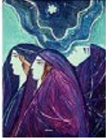
THURAYA AL-BAQSAMI (Kuwaiti, born 1951) Queue 1992 Acrylic 23 5/8 × 19 11/16" (60 × 50 cm) National Council for Culture, Arts and Letters, Kuwait

MoMA PS1, November 03, 2019 - March 01, 2020