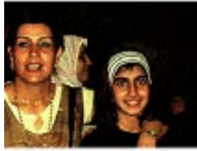
UROK SHIRHAN (Iraqi and Dutch, born 1984) Remake of Paul Chan's "Baghdad in No Particular Order" 2012 2-channel video (color) 35 min. Courtesy the artist

MoMA PS1, November 03, 2019 - March 01, 2020