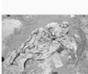
SUSAN MEISELAS (American, born 1948) Koreme, Northern Iraq, Kurdistan June 3, 1992 Digital C-print 16 x 24" (40.6 x 61 cm)