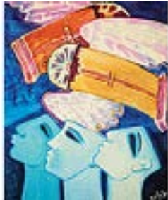
THURAYA AL-BAQSAMI (Kuwaiti, born 1951) Winged Doors 1992 Acrylic 23 5/8 × 19 11/16" (60 × 50 cm)