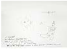
KAREN FINLEY (American, born 1956) Laura Bush Dream Quartet 1-4 2006 Ink on paper; 4 elements Each: 19 × 24" (48.3 × 61 cm)

MoMA PS1, November 03, 2019 - March 01, 2020