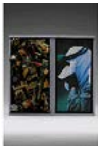
DIA AL-AZZAWI (Iraqi and British, born 1939) Crying Man: Highway of Death 2010 Mixed media with wooden box 12 3/16 × 11 1/4 × 1 15/16" (31 × 28.5 × 5 cm) Courtesy the artist