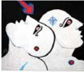
THURAYA AL-BAQSAMI (Kuwaiti, born 1951) The Last Shot 1991 Pastel and acrylic on paper 19 11/16 × 23 5/8" (50 × 60 cm) Sharjah Art Foundation

MoMA PS1, November 03, 2019 - March 01, 2020