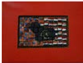
MIGUEL ANGEL RÍOS (Argentinian, born 1943) Souvenir Series: Untitled 1992 Watercolor on cardboard 9 x 12 x 2 1/2" (22.9 x 30.5 x 6.4 cm)