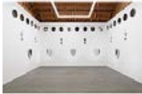
MARY KELLY (American, born 1941) Gloria Patri 1992 Etched and polished aluminum; 31 units total 5 shields, each: 29 × 24 × 2 1/2" (73.7 × 61 × 6.4 cm) 6 trophies, each: 24 × 8 × 2" (61 × 20.3 × 5.1 cm) 20 discs, each: 17 (diameter) × 2 1/4" (43.2 × 5.7 cm) Overall dimensions variable Courtesy the artist, Vielmetter Los Angeles, and Mitchell-Innes & Nash, New York