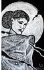
THURAYA AL-BAQSAMI (Kuwaiti, born 1951) The Rape of Venus 1991 Pastel and acrylic 17 11/16 × 13 3/4" (45 × 35 cm) Courtesy the artist

MoMA PS1, November 03, 2019 - March 01, 2020