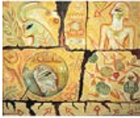
THURAYA AL-BAQSAMI (Kuwaiti, born 1951) Wall of History 1991 Pastel and colored pencil 19 11/16 × 23 5/8" (50 × 60 cm)

MoMA PS1, November 03, 2019 - March 01, 2020