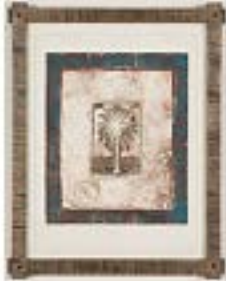
NUHA AL-RADI (Iraqi, 1941–2004) Embargo 1996 Lithograph 11 1/2 × 18 1/2" (29.2 × 47 cm) Private collection, New York