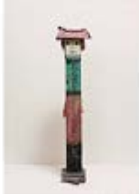
NUHA AL-RADI (Iraqi, 1941–2004) Embargo Sculpture: Woman 2002 Wood, metal, and paint 28 × 8 × 5" (71.1 × 20.3 × 12.7 cm) Collection Aysar Akrawi

MoMA PS1, November 03, 2019 - March 01, 2020