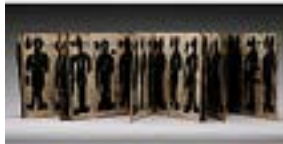
SADIK KWAISH ALFRAJI (Iraqi, born 1960) The Concrete Walls of Baghdad 2007 Ink on paper; 16 concertina pages 9 13/16 × 217 5/16" (25 × 552 cm) Folded: 9 1/16 × 13 9/16" (23 × 34.5 cm) Azzawi Collection, London