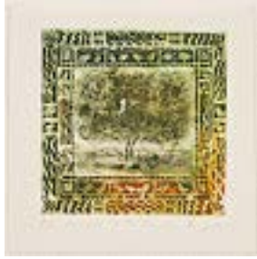
NUHA AL-RADI (Iraqi, 1941–2004) Homage to the Olive Tree 1996 Print 7 1/2 × 7 1/2" (19.1 × 19.1 cm) Collection Aysar Akrawi

MoMA PS1, November 03, 2019 - March 01, 2020