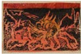
SUE COE (British and American, born 1951) Napalm on Falluja 2005 Colored woodcut on natural Kitakata paper Image: 11 1/4 × 18 1/4" (28.6 × 46.4 cm) Courtesy the artist and Galerie St. Etienne, New York