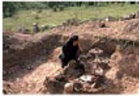
SUSAN MEISELAS (American, born 1948) Sister with her exhumed brother at Koreme mass gravesite. Northern Iraq, Kurdistan June 1992 Digital C-print 16 x 24" (40.6 x 61 cm)