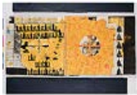
HANAA MALALLAH (Iraqi and British, born 1958) Mesopotamian Triangle: Code and Shape 2003 Mixed media (acrylic, watercolor, collage, cutouts, and burning on paper and wood); 42 pages 16 5/16 × 15 15/16" (41.5 × 40.5 cm) Azzawi Collection, London