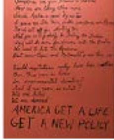
KAREN FINLEY (American, born 1956) The War at Home 1991/2019 Text on wall dimensions variable Courtesy the artist

MoMA PS1, November 03, 2019 - March 01, 2020