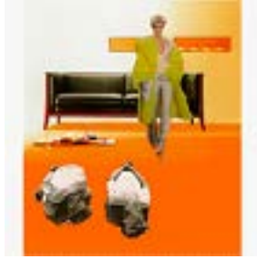
MARTHA ROSLER (American, born 1943) Hooded Captives , from "House Beautiful: Bringing the War Home, New Series" 2004 Photomontage 20 x 24" (50.8 x 61 cm)

MoMA PS1, November 03, 2019 - March 01, 2020