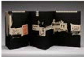
MOHAMMED AL SHAMMAREY (Iraqi and American, born 1962) My Trip from Basra 2003 Mixed media (acrylic and digital collage on canvas and wood); 5 concertina pages 16 15/16 × 13 3/4 × 13/16" (43 × 35 × 2 cm). Overall length: 69" (175 cm) Azzawi Collection, London