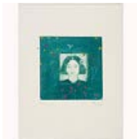
NUHA AL-RADI (Iraqi, 1941–2004) Self Portrait 1996 Lithograph 13 × 10" (33 × 25.4 cm) Collection Aysar Akrawi