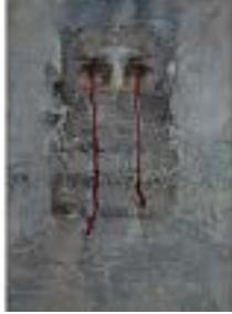
ALI TALIB (Iraqi, born 1944) Mesopotamia 2004 Mixed media on paper 29 15/16 x 22 1/16" (76 x 56 cm) Azzawi Collection, London