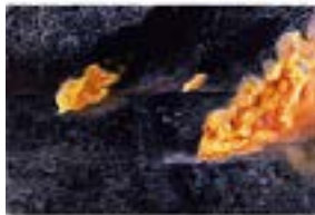
SUSAN CRILE (American, born 1942) Field of Fire 1991 Oil stick, charcoal, pastel, and pumice on paper 40 × 60" (101.6 × 152.4 cm)