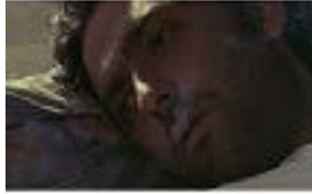
ODAY RASHEED (Iraqi, born 1973) Underexposure 2005 Film (35mm transferred to digital) 74 min.

MoMA PS1, November 03, 2019 - March 01, 2020