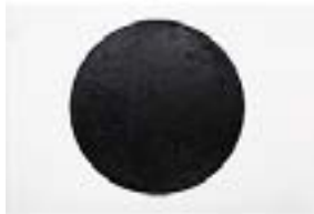
WALLY HEDRICK (American, 1928–2003) Rhondo 1970, 1992, 2002 Oil on canvas 82" (208.3 cm) (diameter) Collection Paul and Karen McCarthy