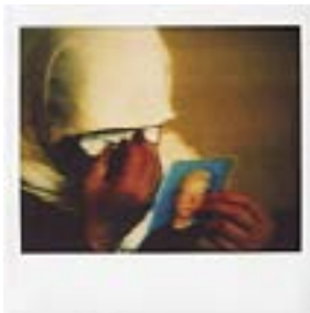
TAREK AL-GHOUSSEIN (Kuwaiti and Palestinian, born 1962) GW 104 1991 Polaroid 11 × 8" (27.9 × 20.3 cm) (framed)