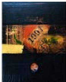
MOHAMMED AL SHAMMAREY (Iraqi and American, born 1962) Desert Storm 2002 Mixed media (acrylic and digital collage on wood); 5 concertina pages 16 15/16 × 13 3/4 × 13/16" (43 × 35 × 2 cm). Overall length: 69" (175 cm) Azzawi Collection, London