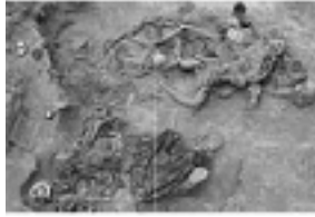
SUSAN MEISELAS (American, born 1948) Koreme, Northern Iraq, Kurdistan May 31, 1992 Digital C-print 12 x 18" (30.5 x 45.7 cm)

MoMA PS1, November 03, 2019 - March 01, 2020