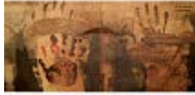
RAFA NASIRI (Iraqi, 1940–2013) Seven Days in Baghdad 2007 Mixed media on paper; 8 folded pages Each: 13 × 27 1/2" (33 × 69.9 cm) (unfolded) Azzawi Collection, London

MoMA PS1, November 03, 2019 - March 01, 2020