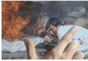
THOMAS HIRSCHHORN (Swiss, born 1957) Touching Reality 2012 Digital video (color) 4 min., 45 sec.

MoMA PS1, November 03, 2019 - March 01, 2020