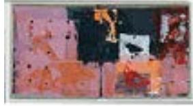
NAZAR YAHYA (Iraqi, born 1963) Cards of Illusion 2001 Mixed media (gouache and collage on paper); 30 pages 6 5/16 × 6 1/8 × 1" (16 × 15.5 × 2.5 cm) Azzawi Collection, London

MoMA PS1, November 03, 2019 - March 01, 2020