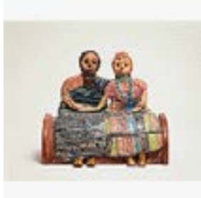
NUHA AL-RADI (Iraqi, 1941–2004) Untitled (Seated Figures) 1992 Ceramic 8 1/2 × 8 1/2 × 6" (21.6 × 21.6 × 15.2 cm) Private collection, New York