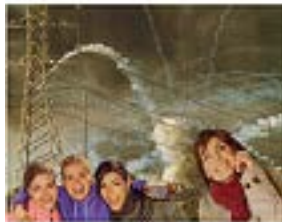
MARTHA ROSLER (American, born 1943) Cellular , from "House Beautiful: Bringing the War Home, New Series" 2004 Photomontage 20 x 24" (50.8 x 61 cm) Courtesy the artist and Mitchell-Innes & Nash, New York