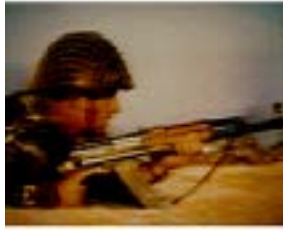
TAREK AL-GHOUSSEIN (Kuwaiti and Palestinian, born 1962) GW 332 1991 Polaroid 11 x 8" (27.9 x 20.3 cm) (framed)

MoMA PS1, November 03, 2019 - March 01, 2020