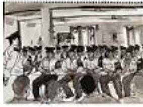
STEVE MUMFORD (American, born 1960) Graduating Class of Iraqi National Guard, Baquba, Iraq 2004 Ink on paper 11 1/4 x 15" (28.6 x 38.1 cm) Courtesy the artist and Postmasters, New York

MoMA PS1, November 03, 2019 - March 01, 2020