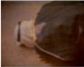
TAREK AL-GHOUSSEIN (Kuwaiti and Palestinian, born 1962) GW 888 1991 Polaroid 11 × 8" (27.9 × 20.3 cm) (framed)