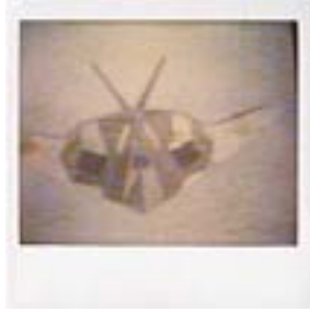
TAREK AL-GHOUSSEIN (Kuwaiti and Palestinian, born 1962) GW 106 1991 Polaroid 11 × 8" (27.9 × 20.3 cm) (framed)

MoMA PS1, November 03, 2019 - March 01, 2020