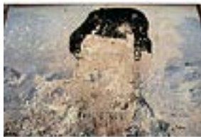
SUSAN MEISELAS (American, born 1948) Destroyed portrait of Saddam Hussein at the security headquarters in Sulaimaniya. Northern Iraq, Kurdistan 1991 Digital C-print 20 × 30" (50.8 × 76.2 cm) Courtesy the artist