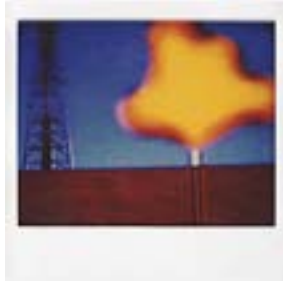
TAREK AL-GHOUSSEIN (Kuwaiti and Palestinian, born 1962) GW 227 1991 Polaroid 11 x 8" (27.9 x 20.3 cm) (framed)