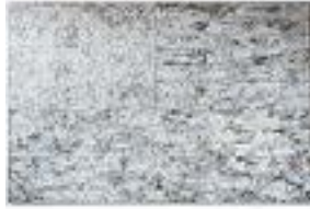
STURTEVANT (American, 1924–2014) Johns White Flag 1991 Collage on canvas 77 15/16 × 120 1/16" (198 × 305 cm) Collection Eleanor and Bobby Cayre, New York

MoMA PS1, November 03, 2019 - March 01, 2020