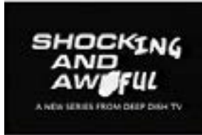
DEEP DISH TV Shocking and Awful: A Grassroots Response to War and Occupation 2004 Series of 12 videos (color, sound) 28 min. each Courtesy the artists