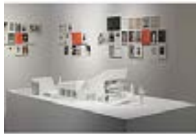
ALA YOUNIS (Jordanian, born Kuwait 1974) Plan (fem.) for Greater Baghdad 2018 Inkjet prints, acrylic, and painted resin Dimensions variable Art Jameel Collection