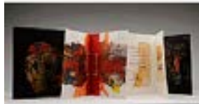
KAREEM RISAN (Iraqi and Canadian, born 1960) The Fires of Baghdad 2003 Mixed media (ink, colored pencil, digital printing, and collage on paper); 13 folded pages loose in cover, in slipcase 12 13/16 × 23 1/4" (32.5 × 59 cm) (unfolded) Case: 12 3/8 × 13 3/8 × 1 3/16" (31.5 × 34 × 3 cm) Azzawi Collection, London