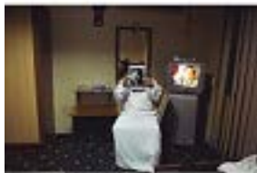
JAMAL PENJWENY (Iraqi and Kurdish, born 1981) Saddam is Here 2010 Photograph 23 5/8 x 31 1/2" (60 x 80 cm)