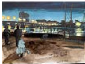
STEVE MUMFORD (American, born 1960) Tigris River at Night, Baghdad, Iraq 2007 Ink and watercolor on paper 11 3/4 × 15 5/8" (29.8 × 39.7 cm) Courtesy the artist and Postmasters, New York