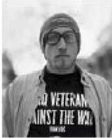
JUDITH JOY ROSS (American, born 1946) Iraq War Veteran Against the War, Allentown, Pennsylvania 2006 Gelatin silver print on printing-out paper, gold toned 10 × 8" (25.4 × 20.3 cm)

MoMA PS1, November 03, 2019 - March 01, 2020