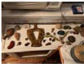
NUHA AL-RADI (Iraqi, 1941–2004) Embargo Rock Art c. 1995 Rocks and paint; 15 pieces Dimensions variable Private Collection, New York