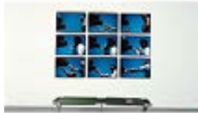
ALLAN SEKULA (American, 1951–2013) War Without Bodies 1991/1996 9 color photographs, mounted and framed, of military air show and Gulf War victory celebration, El Toro Marine Corps Air Station, Santa Ana, California, April 28, 1991; 2 copies of text booklet with illustrated covers; U.S. Army field bed Each: 20 x 30" (50.8 x 76.2 cm) (framed) Overall dimensions variable