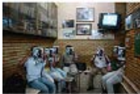
JAMAL PENJWENY (Iraqi and Kurdish, born 1981) Saddam is Here 2010 Photograph 23 5/8 x 31 1/2" (60 x 80 cm)