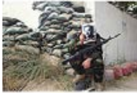
JAMAL PENJWENY (Iraqi and Kurdish, born 1981) Saddam is Here 2010 Photograph 23 5/8 x 31 1/2" (60 x 80 cm)