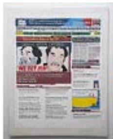
RAINER GANAHL (American, born 1961) FOX NEWS, SADDAM HUSSEIN CAPTURED, 12/14/03 2004 Acrylic on canvas 52 x 40" (132.1 x 101.6 cm) Courtesy the artist and Kai Matsumiya, New York

MoMA PS1, November 03, 2019 - March 01, 2020