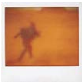
TAREK AL-GHOUSSEIN (Kuwaiti and Palestinian, born 1962) GW 004 1991 Polaroid 11 × 8" (27.9 × 20.3 cm) (framed)