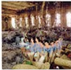
MARTHA ROSLER (American, born 1943) Saddam's Palace (Febreze) , from "House Beautiful: Bringing the War Home, New Series" 2004 Photomontage 20 x 24" (50.8 x 61 cm) Courtesy the artist and Mitchell-Innes & Nash, New York