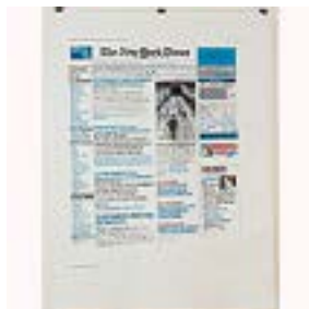
RAINER GANAHL (American, born 1961) THE NEW YORK TIMES, Photos of War Dead Released, 4/29/04 2004 Acrylic on canvas 86 5/8 x 70 7/8" (220 x 180 cm) Courtesy the artist and Kai Matsumiya, New York