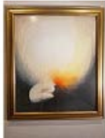
LAYLA AL-ATTAR (Iraqi, 1944–1993) Unfinished painting 1993 Oil on canvas 32 × 28" (81.3 × 71.1 cm) (framed) Private collection