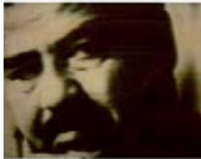
TAREK AL-GHOUSSEIN (Kuwaiti and Palestinian, born 1962) GW 969 1991 Polaroid 11 × 8" (27.9 × 20.3 cm) (framed)