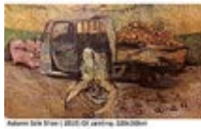
ALI EYAL (Iraqi, born 1994) Autumn Solo Show 2018 Oil on canvas 63 × 86 5/8" (160 × 220 cm) Azzawi Collection, London