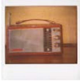
TAREK AL-GHOUSSEIN (Kuwaiti and Palestinian, born 1962) GW 101 1991 Polaroid 11 × 8" (27.9 × 20.3 cm) (framed) Courtesy the artist and The Third Line, Dubai

MoMA PS1, November 03, 2019 - March 01, 2020