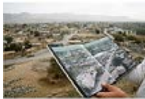
SUSAN MEISELAS (American, born 1948) The rebuilt town of Qala Diza, destroyed in the Anfal campaign by Saddam Hussein, and photographed in 1991. (Page from KURDISTAN IN THE SHADOW OF HISTORY, 1997) Northern Iraq, Kurdistan 2007 Digital C-print 40 × 60" (101.6 × 152.4 cm)