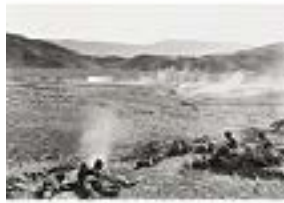
AN-MY LÊ (American, born Vietnam 1960) 29 Palms: Infantry Platoon (Machine Gunners) 2003-04 Gelatin silver print 26 1/2 x 38 1/16" (67.3 x 96.7 cm) The Museum of Modern Art, New York. Robert B. Menschel Fund

MoMA PS1, November 03, 2019 - March 01, 2020