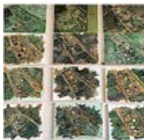
ALI EYAL (Iraqi, born 1994) Autumn Solo Show (Work in Progress) 2019 - ongoing Oil on canvas 20 canvases, each: 9 7/16 × 13 3/4" (24 × 35 cm) Courtesy the artist