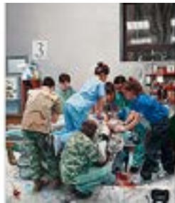
STEVE MUMFORD (American, born 1960) Dying Soldier 2009 Oil on linen 84 × 72" (213.4 × 182.9 cm) Courtesy the artist and Postmasters, New York