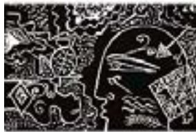
THURAYA AL-BAQSAMI (Kuwaiti, born 1951) Witness 1990 Linocut 7 7/8 × 11 13/16" (20 × 30 cm)