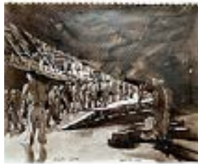
STEVE MUMFORD (American, born 1960) Prisoners Being Loaded onto C-17, Mosul, Iraq 2008 Ink on paper 14 × 18" (35.6 × 45.7 cm) Courtesy the artist and Postmasters, New York