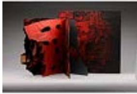
KAREEM RISAN (Iraqi and Canadian, born 1960) Al Mutanabbi Street 2007 Mixed media on paper mounted on board; cover with 4 pages Each: 16 1/2 × 16 1/2" (41.9 × 41.9 cm) Azzawi Collection, London

MoMA PS1, November 03, 2019 - March 01, 2020