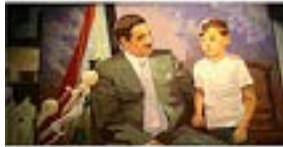
ALA YOUNIS (Jordanian, born Kuwait 1974) National Works 2012/2019 Digital video (color, sound) 7 min., 45 sec.