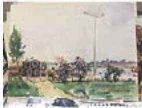
STEVE MUMFORD (American, born 1960) Combat Outpost "Hotel," Mosul, Iraq 2008 Ink on paper 13 3/4 x 18" (34.9 x 45.7 cm)