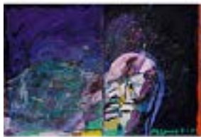
DIA AL-AZZAWI (Iraqi and British, born 1939) War Diary No. 3 1991 Gouache, China ink, and charcoal on paper; 62 pages 12 5/8 × 9 7/16" (32 × 24 cm) Case: 15 3/4 × 11 13/16" (40 × 30 cm)