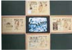
RASHEED ARAEEN (Pakistani and British, born 1935) Heroes 1991-1992 Photographs, newspaper, and acrylic on plywood 72 13/16 × 108 11/16" (185 × 276 cm) Private collection, Switzerland