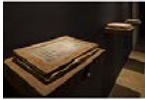
MAHMOUD OBAIDI (Iraqi and Canadian, born 1966) Compact Home 2003/2004 7 metal boxes containing metal books Each: 13 3/4 x 9 7/16" (35 x 24 cm) Courtesy the artist

MoMA PS1, November 03, 2019 - March 01, 2020