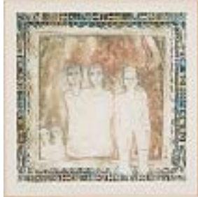
NUHA AL-RADI (Iraqi, 1941–2004) A'in Ghazzal I 1996 Lithograph 20 × 19 1/2" (50.8 × 49.5 cm) Collection Aysar Akrawi