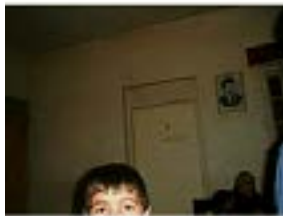
PAUL CHAN (American, born Hong Kong 1973) Baghdad in No Particular Order 2003 Single-channel video (color, sound) 51 min.