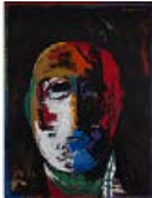
DIA AL-AZZAWI (Iraqi and British, born 1939) Victim's Portrait 1991 Acrylic on paper; exhibited with archival newspaper clipping 62 5/8 × 47 5/8" (159 × 121 cm) Courtesy the artist