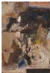
SHAKIR HASSAN AL SAID (Iraqi, 1925–2004) Wall #1 1991 Oil on wood panel 25 3/16 × 17 11/16" (64 × 45 cm) Barjeel Art Foundation, Sharjah