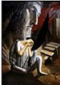
AFIFA ALEIBY (Iraqi and Dutch, born 1952) War Painting (The Destruction of Iraq) 1991 Oil on canvas 27 9/16 × 19 11/16" (70 × 50 cm) Barjeel Art Foundation, Sharjah