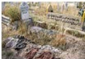
SUSAN MEISELAS (American, born 1948) Clothes found around exhumed bones mark unknown grave in Erbil cemetery. Northern Iraq, Kurdistan December 1991 Digital C-print 16 × 24" (40.6 × 61 cm) Courtesy the artist