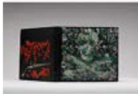
DELAIR SHAKER (Iraqi and American, born 1971) Crawling Agenda 2009 Mixed media (collage and found objects on paper) 10 7/16 × 12 × 1 9/16" (26.5 × 30.5 × 4 cm) Azzawi Collection, London