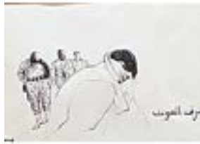
GHAITH ABDULAHAD (Iraqi, born 1975) An Iraqi man detained north of Baghdad by an Iraqi commandos unit, one of the many death squad units under command of the Ministry of Interior at that time. 2005 Ink on notebook paper Courtesy the artist

MoMA PS1, November 03, 2019 - March 01, 2020