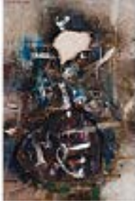
SHAKIR HASSAN AL SAID (Iraqi, 1925–2004) Fragmentation No. 1 1991 Mixed media on wood 50 × 38 3/16" (127 × 97 cm) Azzawi Collection, London

MoMA PS1, November 03, 2019 - March 01, 2020