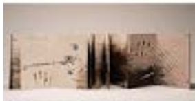
RAFA NASIRI (Iraqi, 1940–2013) Untitled 1991 Acrylic, graphite, and ink on paper 12 5/8 × 9 1/16 × 1" (32 × 23 × 2.5 cm) Case: 15 3/4 × 11 13/16 × 2 3/4" (40 × 30 × 7 cm) Azzawi Collection, London