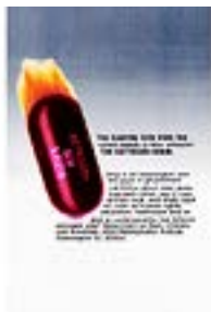
GUERRILLA GIRLS (Est. 1985) Estrogen Bomb 2003-2017 Poster 24 x 24" (61 x 61 cm) Courtesy the artists