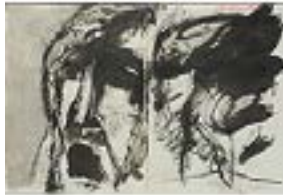
DIA AL-AZZAWI (Iraqi and British, born 1939) War Diary No. 2 1991 Gouache, China ink, and charcoal on paper; 38 pages 12 5/8 × 9 7/16" (32 × 24 cm) Case: 15 3/4 × 11 13/16" (40 × 30 cm)