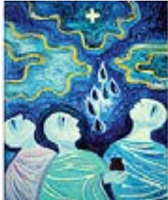
THURAYA AL-BAQSAMI (Kuwaiti, born 1951) Bu Skheir's Thirst 1992 Acrylic 25 9/16 × 21 5/8" (65 × 55 cm)