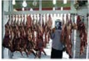
JAMAL PENJWENY (Iraqi and Kurdish, born 1981) Saddam is Here 2010 Photograph 23 5/8 x 31 1/2" (60 x 80 cm)

MoMA PS1, November 03, 2019 - March 01, 2020