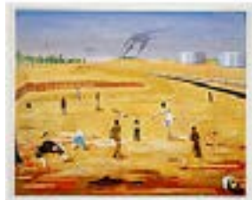
VERNE DAWSON (American, born 1961) Massacre 2004 Oil on canvas 70 x 86" (177.8 x 218.4 cm) Ringier Collection, Switzerland