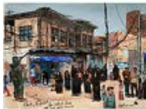
STEVE MUMFORD (American, born 1960) US Mobile Medical Clinic Attracting Iraqis, Baghdad 2007 Ink and gouache on paper 11 3/4 × 15 5/8" (29.8 × 39.7 cm)