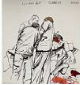
STEVE MUMFORD (American, born 1960) Last Ditch Effort, Baghdad ER 2007 Ink on paper 12 1/2 × 11 7/8" (31.8 × 30.2 cm)

MoMA PS1, November 03, 2019 - March 01, 2020