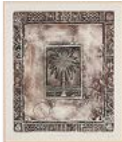
NUHA AL-RADI (Iraqi, 1941–2004) Embargo 1997 Lithograph 20 × 17 1/2" (50.8 × 44.5 cm) Collection Aysar Akrawi