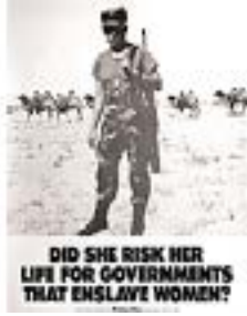
GUERRILLA GIRLS (Est. 1985) Did She Risk Her Life For Governments That Enslave Women? 1991 Poster 22 × 17" (55.9 × 43.2 cm) Courtesy the artists

MoMA PS1, November 03, 2019 - March 01, 2020