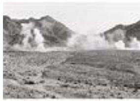
AN-MY LÊ (American, born Vietnam 1960) 29 Palms: Mortar Impact 2003-04 Gelatin silver print 26 1/2 x 38 1/16" (67.3 x 96.7 cm) The Museum of Modern Art, New York. Robert B. Menschel Fund