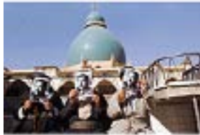
JAMAL PENJWENY (Iraqi and Kurdish, born 1981) Saddam is Here 2010 Photograph 23 5/8 x 31 1/2" (60 x 80 cm)