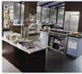
MARTHA ROSLER (American, born 1943) Election (Lynndie) , from "House Beautiful: Bringing the War Home, New Series" 2004 Photomontage 20 x 24" (50.8 x 61 cm)

MoMA PS1, November 03, 2019 - March 01, 2020