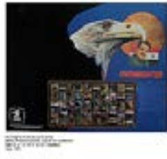
MIGUEL ANGEL RÍOS (Argentinian, born 1943) Souvenir Series: Overnighter 1991 Priority Mail box, acrylic on cardboard 12 1/2 x 15 1/2 x 3 1/4" (31.7 x 39.3 x 8.2 cm) Courtesy the artist and Sicardi Ayers Bacino

MoMA PS1, November 03, 2019 - March 01, 2020