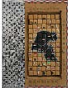
MIGUEL ANGEL RÍOS (Argentinian, born 1943) Souvenir Series: Tormenta del Desierto 1992 Watercolor on cardboard and metallic paper 24 x 18 1/8 x 3" (61 x 46 x 7.5 cm) Courtesy the artist and Sicardi Ayers Bacino