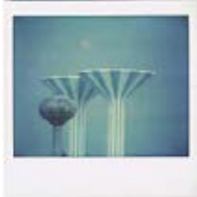
TAREK AL-GHOUSSEIN (Kuwaiti and Palestinian, born 1962) GW 162 1991 Polaroid 11 × 8" (27.9 × 20.3 cm) (framed)