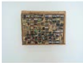
MIGUEL ANGEL RÍOS (Argentinian, born 1943) Souvenir Series: OIL 1992 Watercolor on cardboard 8 1/4 x 10 5/8 x 1 1/8" (21 x 27 x 3 cm)