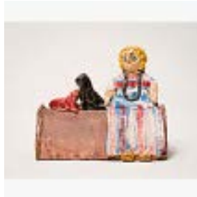
NUHA AL-RADI (Iraqi, 1941–2004) Nuha and her cat on a bench c. 1990 Ceramic 6 × 5 × 3" (15.2 × 12.7 × 7.6 cm) Collection Aysar Akrawi