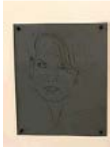
KAREN FINLEY (American, born 1956) Portrait of Condi 2006 Pencil on sandpaper 11 × 9" (27.9 × 22.9 cm) Courtesy the artist