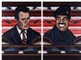
ROGER BROWN (American, 1941–1997) Gulf War 1991 Oil on canvas 2 panels, each: 36 × 24" (91.4 × 61 cm) Courtesy The School of the Art Institute of Chicago's Roger Brown Estate and Kavi Gupta, Chicago