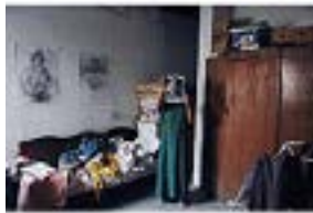
JAMAL PENJWENY (Iraqi and Kurdish, born 1981) Saddam is Here 2010 Photograph 23 5/8 x 31 1/2" (60 x 80 cm)