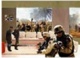
MARTHA ROSLER (American, born 1943) GLADIATORS , from "House Beautiful: Bringing the War Home, New Series" 2004 Photomontage 20 x 24" (50.8 x 61 cm)