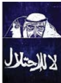
THURAYA AL-BAQSAMI (Kuwaiti, born 1951) No to the Invasion 1990 Linocut print 15 3/4 × 11 13/16" (40 × 30 cm) Barjeel Art Foundation, Sharjah