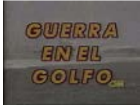
ALIA FARID (Puerto Rican and Kuwaiti, born 1985) Theater of Operations (The Gulf War seen from Puerto Rico) 2017 Found footage and audio (color, sound) 3 hrs., 53 min., 28 sec. Courtesy the artist

MoMA PS1, November 03, 2019 - March 01, 2020