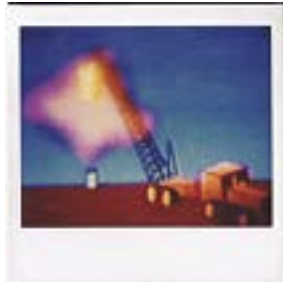
TAREK AL-GHOUSSEIN (Kuwaiti and Palestinian, born 1962) GW 226 1991 Polaroid 11 x 8" (27.9 x 20.3 cm) (framed)