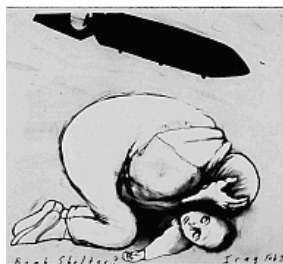
SUE COE (British and American, born 1951) Bomb Shelter 1991 Photo-etching on white heavyweight Rives paper Image: 9 5/8 x 10 1/2" (24.4 x 26.7 cm) Courtesy the artist and Galerie St. Etienne, New York