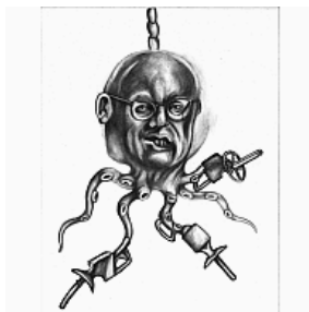
SUE COE (British and American, born 1951) Oily Creature 2004 Graphite on white Strathmore Bristol board 9 3/8 × 7 5/8" (23.8 × 19.4 cm) Courtesy the artist and Galerie St. Etienne, New York