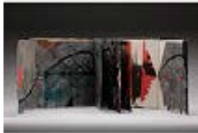
GHASSAN GHAIB (Iraqi and American, born 1964) Document 3 2003 Mixed media (collage and digital print on paper); 28 pages 12 3/16 × 12 3/16" (31 × 31 cm) Azzawi Collection, London