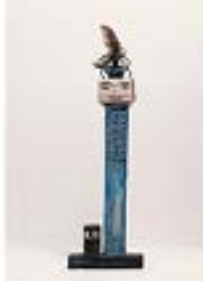
NUHA AL-RADI (Iraqi, 1941–2004) Embargo Sculpture: Man and Child 2002 Wood, metal, and paint 33 × 10 × 3 1/2" (83.8 × 25.4 × 8.9 cm) Collection Aysar Akrawi