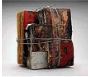
GHASSAN GHAIB (Iraqi and American, born 1964) Homage to al-Mutanabbi Street 1 2007 Mixed media (found object and barbed wire) 12 5/8 × 9 7/16 × 9 7/16" (32 × 24 × 24 cm) Azzawi Collection, London

MoMA PS1, November 03, 2019 - March 01, 2020