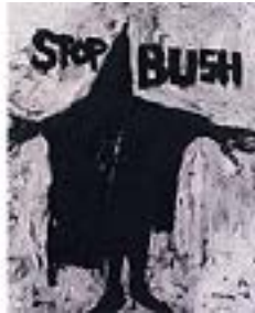
RICHARD SERRA (American, born 1938) Stop Bush 2004 Lithocrayon on mylar 59 x 48" (149.9 x 121.9 cm) Collection Richard Serra