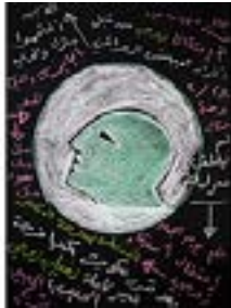
THURAYA AL-BAQSAMI (Kuwaiti, born 1951) Letter from a Prisoner's Wife 1990 Colored pencil and pastel on paper 12 5/8 × 9 13/16" (32 × 25 cm) Courtesy the artist