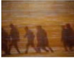
TAREK AL-GHOUSSEIN (Kuwaiti and Palestinian, born 1962) GW 58 1991 Polaroid 11 × 8" (27.9 × 20.3 cm) (framed)

MoMA PS1, November 03, 2019 - March 01, 2020