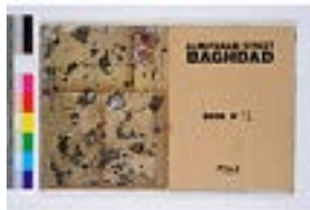
HIMAT M. ALI (Iraqi, born 1960) Al Mutanabbi Street Baghdad 2007 Mixed media on paper; 12 bound books in wooden slipcase Each: 13 3/8 × 9 13/16" (34 × 25 cm) In slipcase: 15 3/16 × 11 13/16 × 8 7/16" (38.5 × 30 × 21.5 cm) Azzawi Collection, London