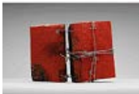
GHASSAN GHAIB (Iraqi and American, born 1964) Occupation 2007 Mixed media (found object and barbed wire) 11 × 18" (27.9 × 45.7 cm) Azzawi Collection, London