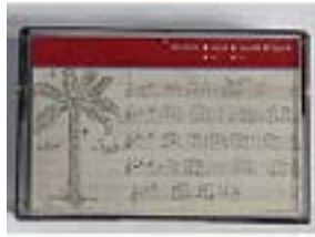
SHERKO ABBAS (Iraqi, born 1978) The Music of the Bush Era 2017 Two-channel video (color, sound); installation with objects Dimensions variable Courtesy the artist and Ruya Foundation

MoMA PS1, November 03, 2019 - March 01, 2020