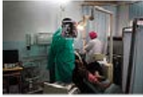
JAMAL PENJWENY (Iraqi and Kurdish, born 1981) Saddam is Here 2010 Photograph 23 5/8 x 31 1/2" (60 x 80 cm)

MoMA PS1, November 03, 2019 - March 01, 2020