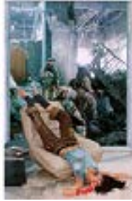
MARTHA ROSLER (American, born 1943) Lounging Woman , from "House Beautiful: Bringing the War Home, New Series" 2004 Photomontage 20 x 24" (50.8 x 61 cm)