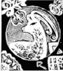
THURAYA AL-BAQSAMI (Kuwaiti, born 1951) Who Killed the Deer 1991 Etching 10 1/4 × 9 1/16" (26 × 23 cm) Courtesy the artist