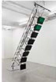
DARA BIRNBAUM (American, born 1946) Transmission Tower: Sentinel 1992 Eight-channel color video (2 min., 48 sec.), nine-channel stereo sound, Rohn transmission tower, custom-designed hardware and brackets, and computer for synchronization Dimensions variable Courtesy the artist and Marian Goodman Gallery, New York, London, Paris