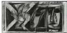
DIA AL-AZZAWI (Iraqi and British, born 1939) War Diary: Book of Darkness 1991 Charcoal and gouache on paper; hardcover, black with white card and red paint; 40 pages including front inside cover 10 1/4 × 10 1/16 × 1 3/8" (26 × 25.5 × 3.5 cm) Case: 11 13/16 × 11 7/16 × 1 3/8" (30 × 29 × 3.5 cm)