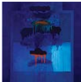
RAFA NASIRI (Iraqi, 1940–2013) Untitled 2008 Acrylic on canvas 55 1/8 x 55 1/8" (140 x 140 cm) Courtesy Rafa Nasiri Studio, Amman