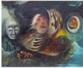
KHALIFA QATTAN (Kuwaiti, 1934–2003) Desert Storm 1979 Oil on fiber 19 11/16 × 23 5/8" (50 × 60 cm) The Khalifa & Lidia Qattan Art Museum (The Mirror House), Kuwait

MoMA PS1, November 03, 2019 - March 01, 2020