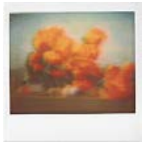
TAREK AL-GHOUSSEIN (Kuwaiti and Palestinian, born 1962) GW 664 1991 Polaroid 11 x 8" (27.9 x 20.3 cm) (framed)