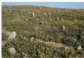
SUSAN MEISELAS (American, born 1948) Field designated for anonymous graves of children killed in the Anfal. Jaznikam-Beharke, Northern Iraq, Kurdistan. 1991 Digital C-print 12 x 18" (30.5 x 45.7 cm)