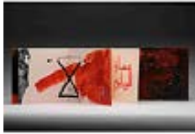
KAREEM RISAN (Iraqi and Canadian, born 1960) Uranium Civilization 2002 Ink, watercolor, and collage on card; 16 folded pages loose in cover, in slipcase 11 5/8 × 23 1/4" (29.5 × 59 cm) Case: 12 3/16 × 11 13/16 × 1 3/8" (31 × 30 × 3.5 cm) Azzawi Collection, London

MoMA PS1, November 03, 2019 - March 01, 2020