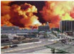
JON KESSLER (American, born 1957) Shock and Awe 2005 CCTV camera, monitor, steel, ink jet print, tape, and density filters Dimensions variable Courtesy the artist