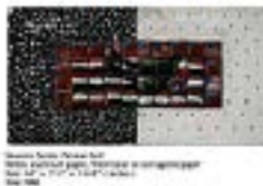
MIGUEL ANGEL RÍOS (Argentinian, born 1943) Souvenir Series: Persian Gulf 1992 Aluminum paper and watercolor on cardboard 14 3/16 x 7 1/2 x 1 3/4" (36.1 x 19.1 x 4.4 cm) Courtesy the artist and Sicardi Ayers Bacino