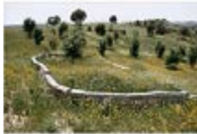
SUSAN MEISELAS (American, born 1948) Concrete blocks mark the mass grave in Koreme. Northern Iraq, Kurdistan 1992 Digital C-print 20 × 30" (50.8 × 76.2 cm) Courtesy the artist