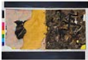
HANAA MALALLAH (Iraqi and British, born 1958) Book of Sanction 2 2002 Mixed media (acrylic, collage, and burning on paper and carved wood, with metal) 15 3/4 × 15 3/4" (40 × 40 cm) Azzawi Collection, London