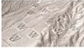
JANANNE AL-ANI (Iraqi, Irish, and British, born 1966) Shadow Sites II 2011 Single-channel digital video (color, sound) 8 min., 38 sec.

MoMA PS1, November 03, 2019 - March 01, 2020