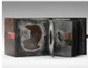
NAZAR YAHYA (Iraqi, born 1963) Baghdad Day of Destruction 2003 Mixed media (acrylic, collage, and burning on paper, with ceramic, glass, and wood); 50 pages 5 1/2 × 5 5/16 × 4 15/16" (14 × 13.5 × 12.5 cm) Azzawi Collection, London