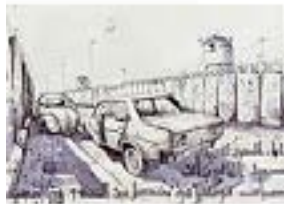
GHAITH ABDULAHAD (Iraqi, born 1975) A no-mans-land separating a Shia neighbourhood from a Sunni one in Baghdad. 2008 Ink on notebook paper Courtesy the artist