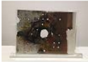
SHAKIR HASSAN AL SAID (Iraqi, 1925–2004) Untitled 1994 Mixed media on paper 12 5/8 × 15 3/4" (32 × 40 cm)