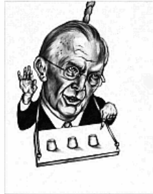
SUE COE (British and American, born 1951) Rummy - The Con Man 2004 Graphite on white Strathmore Bristol board 9 3/8 × 7 5/8" (23.8 × 19.4 cm)