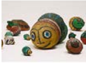
NUHA AL-RADI (Iraqi, 1941–2004) Embargo Rock Art 1995 Rocks and paint; 15 pieces Dimensions variable Collection Aysar Akrawi

MoMA PS1, November 03, 2019 - March 01, 2020