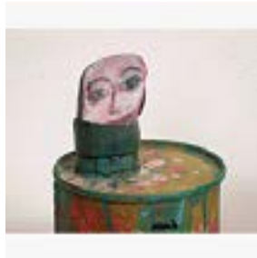
NUHA AL-RADI (Iraqi, 1941–2004) Portrait of Zain Habboo 1995 Painted metal canister and rock 10 × 6" (25.4 × 15.2 cm) Collection Aysar Akrawi