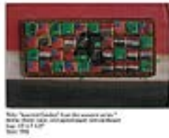
MIGUEL ANGEL RÍOS (Argentinian, born 1943) Souvenir Series: Assorted Candies 1992 Watercolor on cardboard 8 5/8 x 11 3/4 x 1 1/8" (22 x 30 x 3 cm)