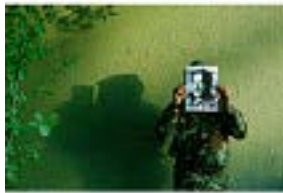
JAMAL PENJWENY (Iraqi and Kurdish, born 1981) Saddam is Here 2010 Photograph 23 5/8 x 31 1/2" (60 x 80 cm)