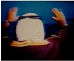
TAREK AL-GHOUSSEIN (Kuwaiti and Palestinian, born 1962) GW 886 1991 Polaroid 11 × 8" (27.9 × 20.3 cm) (framed)