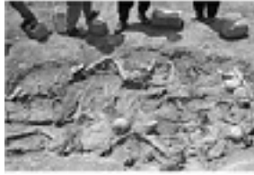
SUSAN MEISELAS (American, born 1948) Grave B South. Koreme, Northern Iraq, Kurdistan. June 1992 Digital C-print 12 x 18" (30.5 x 45.7 cm)

MoMA PS1, November 03, 2019 - March 01, 2020