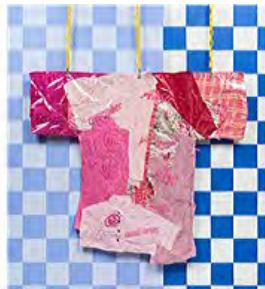
ZOË PULLEY (American, born 1993) A Blouse for Melanie Blagburn 2024 Fabric, plastic vinyl, and thread 55 × 49" (139.7 × 124.5 cm)