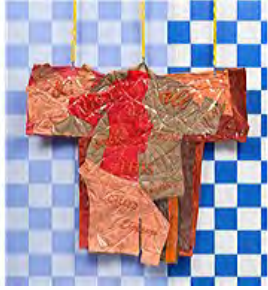
ZOË PULLEY (American, born 1993) A Suit for Brett Pulley 2024 Fabric, plastic vinyl, and thread 55 × 51" (139.7 × 129.5 cm) Courtesy the artist

MoMA PS1, September 26, 2024 - February 10, 2025