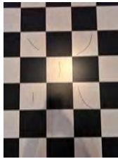
ZOË PULLEY (American, born 1993) Rememory Note 2024 Purple pendant light, printed text, and four-channel audio (15 min., 1 sec. looped) Dimensions variable Courtesy the artist