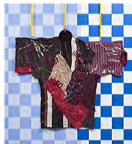
ZOË PULLEY (American, born 1993) A Shirt for Angela Hill 2024 Fabric, plastic vinyl, and thread 58 1/2 × 49" (148.6 × 124.5 cm) Courtesy the artist