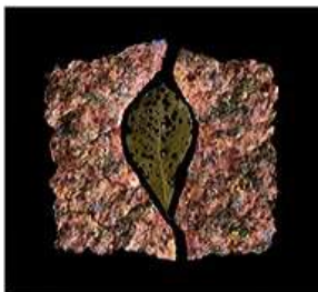
AMI LIEN (American, born 1987) ENZO CAMACHO (Filipino, born 1985) Hunger Leaf (curled) 2024 Calophyllum (bitalog) leaf, watercolor, beeswax, abaca pulp, banana stalk, cogon grass, cilantro, fennel, parsley, spring onion, and taro shoots 16 1/2 × 18 1/8" (41.9 × 46 cm) Framed: 24 1/4 × 26 3/4" (61.6 × 67.9 cm) Courtesy the artists and 47 Canal, New York