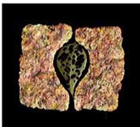
AMI LIEN (American, born 1987) ENZO CAMACHO (Filipino, born 1985) Hunger Leaf (weeping wounds) 2024 Calophyllum (bitalog) leaf, watercolor, beeswax, abaca pulp, banana stalk, coconut husk, cilantro, nipa, parsley, seaweed, spring onion, and taro shoots 18 1/8 × 20 5/8" (46 × 52.4 cm) Framed: 24 1/4 × 26 3/4" (61.6 × 67.9 cm)