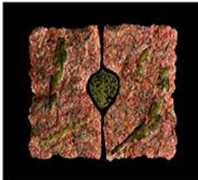
AMI LIEN (American, born 1987) ENZO CAMACHO (Filipino, born 1985) Hunger Leaf (flagellation) 2024 Calophyllum (bitalog) leaf, watercolor, beeswax, abaca pulp, banana stalk, coconut husk, cilantro, nipa, parsley, seaweed, spring onion, and taro shoots 16 1/2 × 18 1/8" (41.9 × 46 cm) Framed: 24 1/4 × 26 3/4" (61.6 × 67.9 cm)