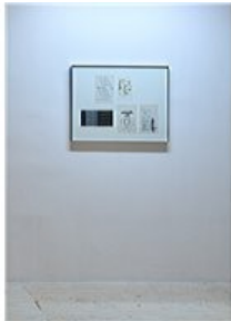
NIKHIL VETTUKATTIL, b. 1990, Bengaluru Notes and Sketches for Timepiece 2025 Graphite and ink on paper and found textbook pages with digital inkjet print 25 1/4 × 32 1/4" (64.1 × 81.9 cm) Courtesy the artist and Arcadia Missa, London