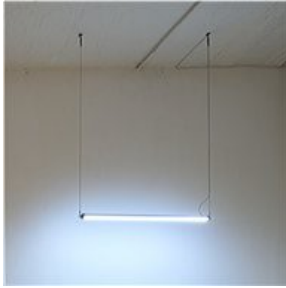
NIKHIL VETTUKATTIL, b. 1990, Bengaluru Light Fixture for Timepiece 2025 LED with custom sequence 40 11/16 × 1 5/8" (103.4 × 4.1 cm)