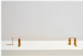
MICHÈLE GRAF & SELINA GRÜTER, b. 1987, Wetzikon; b. 1991, Zurich Machine 2024 Painted hardware and electronics 4 × 6 3/4 × 97" (10.2 × 17.1 × 246.4 cm) Courtesy the artists and Fanta-MLN, Milan